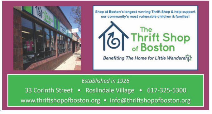
Examples of previous sponsor ads in the ROS brochure