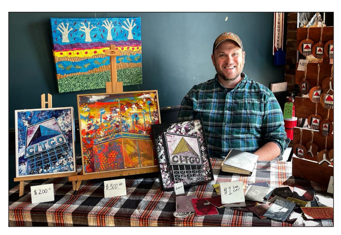
The Square Root