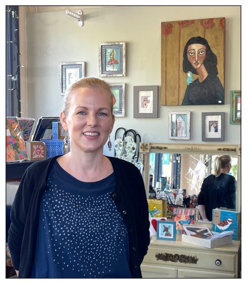
Birch St. House & Garden