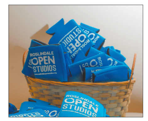
Promotional Koozies handed out at the Farmers' Market